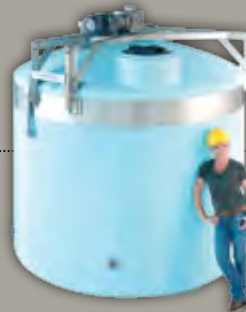
MIXT 2500 2500 Gallon Tank System 8' diam. x 7'8" height