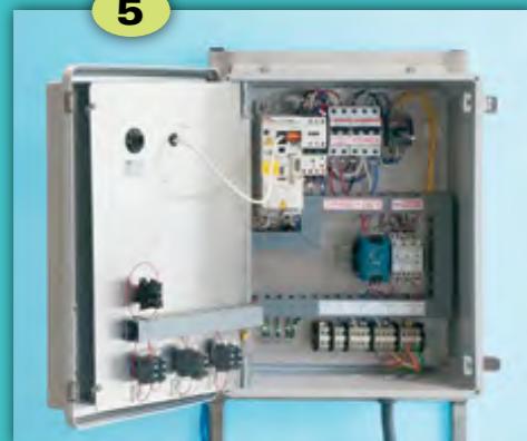
Control Panels are designed to be easy to operate and maintain.