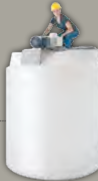
MIXT 650 650 Gallon Tank System 56" diam. x 7'9" height

MIXT Tanks are available in 300, 650, 2500, 3000, 6000 and 10,000 gallon capacities, with your choice of 120, 240 or 480V service panels.