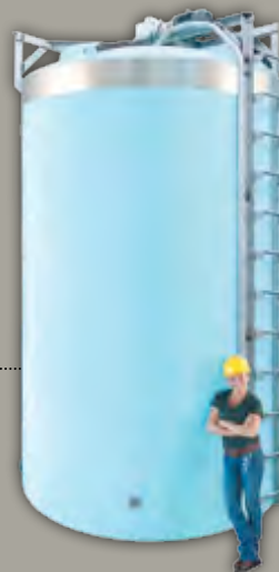
MIXT 6000 6000 Gallon Tank System 8' diam. x 15' height