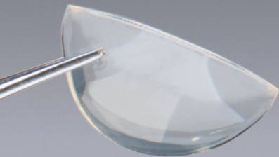
Clear Cornea Half-Moon Split Thickness