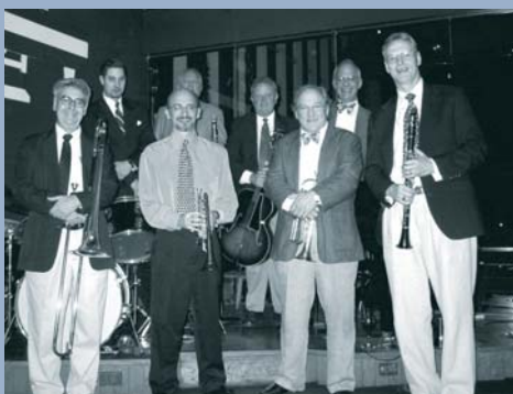
San Antonio, Texas