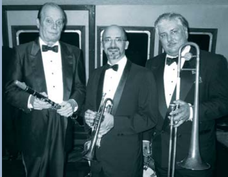
San Diego, California